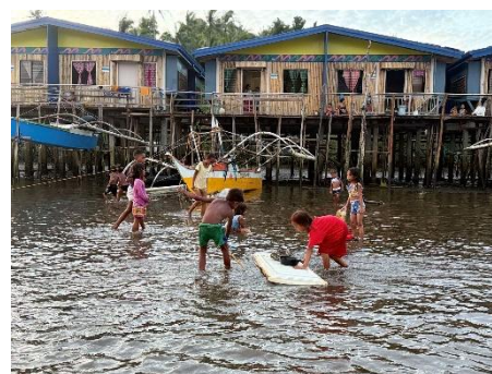
The FORMER houses of the Sama Bajau for almost 50 years and the CURRENT resettlement site at DENR Ecovillage