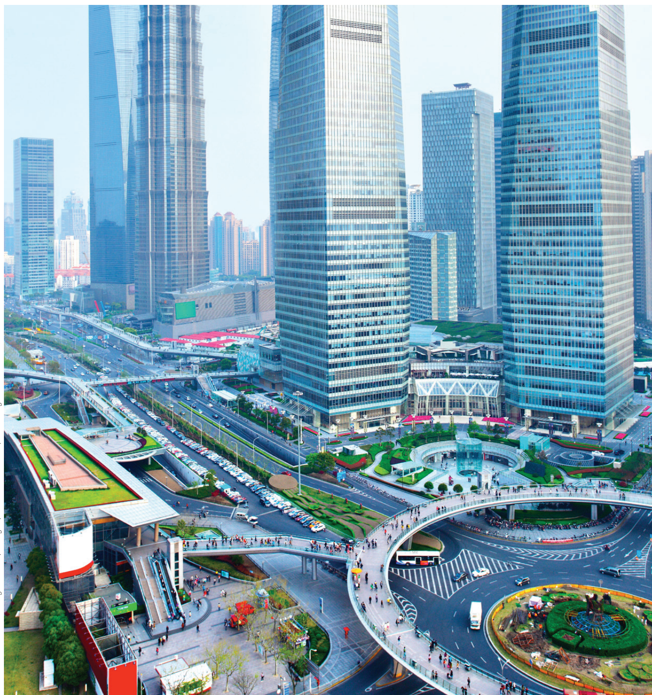
View of Pudong New Area, Shanghai, China

Ministry of Housing and Urban-Rural Development and other national government institutions in China; top officials from UN-Habitat and other UN agencies; Mayors and representatives of various cities around the world; representatives of universities, research institutes; experts and scholars; and the media. Six parallel conferences on public diplomacy, new-type urbanization, infrastructure development, strategic planning, urban transformation, and urban health were also organized.