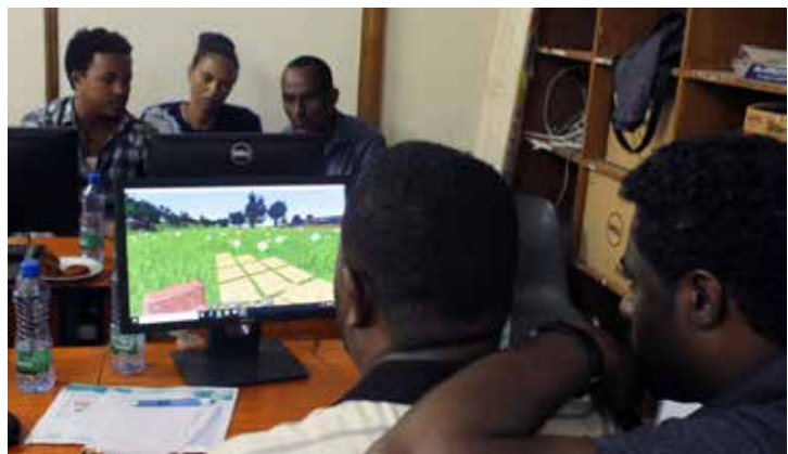
Public Space Design using digital tools