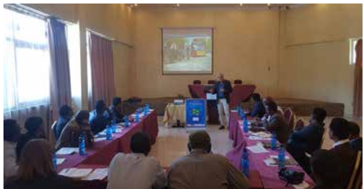
Experts Group Meeting

Addis Ababa, 31 October 2019: On the World Cities days "Better City, Better Life", Addis Ababa recognized its residents, as well as experts and High-level Decision makers who were part of the Ras Mekonnen River and River Front Rehabilitation and Seba Dereja Historical Site Restorations Project. These public space champions were awarded certificates and diploma as proof of acknowledgements and as appreciation of their contributions. On the same day (on 31st of October) the city opened a Photo Exhibition in the newly rehabilitated public space to showcase the transformation of the site, what's steps taken and how residents involved in all the process of the project.