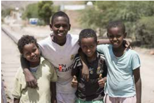
Dire Dawa, Ethiopia

Addis Ababa, October 2019: Two Urban Cinema sessions related to the theme of the week were organized to complement the discussions held during the Urban Dialogues and the radio debates. The Brazilian documentary “Waste Land” and the movie “Citizen Jane: Battle for the city” were screened to further inform on the challenges of solid waste and urban planning respectively. It was meant to reflect on the experiences of other countries related to urban challenges that are also faced in Ethiopia. There was free entry to the events, attracting good crowds.