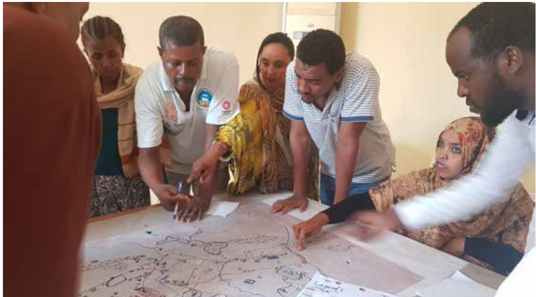
City Resilience Action Planning Crash Course in Dire Dawa

was organized as a series of interactive sessions which included group exercises, games, audio-visual material, debates etc. and it was run by local focal points that had previously been trained on the tool by UN-Habitat. At the end of the CityRAP crash course, participants produced a risk map of the city of Dire Dawa in a participatory manner.