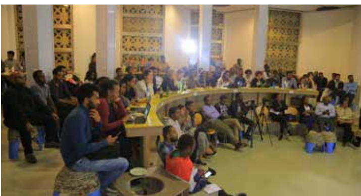
Urban Dialogue Session held in Addis Ababa, Ethiopia

Addis Ababa, October 2019: UN-Habitat Ethiopia organized a series of events open to all throughout the month of October to discuss urban opportunities and challenges in Ethiopia, as well as to present practices and lessons learnt from abroad. These events were organized in collaboration with the Urban Center, the Association of Ethiopian Architects and the Ethiopia Urban Planners Association. Each week, an urban theme was defined and discussed at the events. The themes included housing,