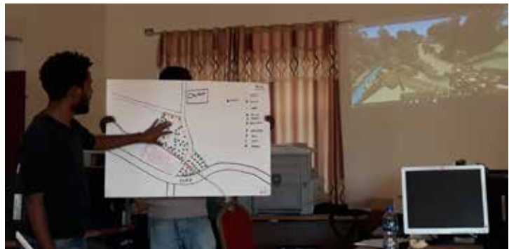
Digital Tools for Public Space Design

Over 350 residents, youth and experts from different disciplines participated in using the digital tools as part of the Urban October 2019 celebrations. The events were held in Adama, Addis Ababa, Dire Dawa, Hawassa, Mekelle and Bahirdar cities. Hawassa and Adama city mapped their public spaces using smartphones while Dire Dawa, Adama and Mekelle cities engaged their residents to redesign their public spaces.