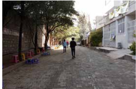
Public Space in Mekelle, Ethiopia.

Ethiopia, 1 – 11 October 2019: UN-Habitat is working with residents of six cities in Ethiopia to make sure cities are for people themselves. UN-Habitat is also working with the National Government, Local Governments and with other stakeholders to make sure the vast urbanization in the country considered the most vulnerable elements in urban centres, urbanization with a better focus on public space to tackle various challenges in the urbanization process. The Urban October 2019 celebrated widely in different cities in Ethiopia, Addis Ababa the capital and most of the regional capital cities.