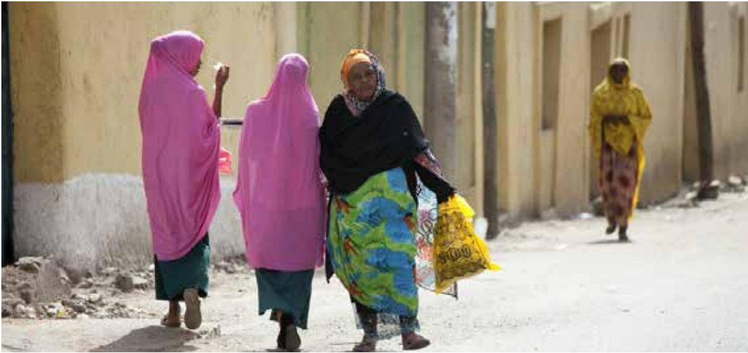
Jigjiga, Ethiopia

Jigjiga, 31 October 2019: The official launching meeting of the Jigjiga City Structure Plan Revision was held at the Regional President's Office, at the invitation of the Regional Government of Somali. It brought together close to 35 participants (officials and key staff members) representing the regional cabinet, Bureau of Urban Development and Construction, Jigjiga City Administration and community as well as the Bureau of Urban Plan Preparation and Implementation. There was a follow up from the Ministry of Urban Development and Construction (MUDDCo) and UN-Habitat Ethiopia Country Office.